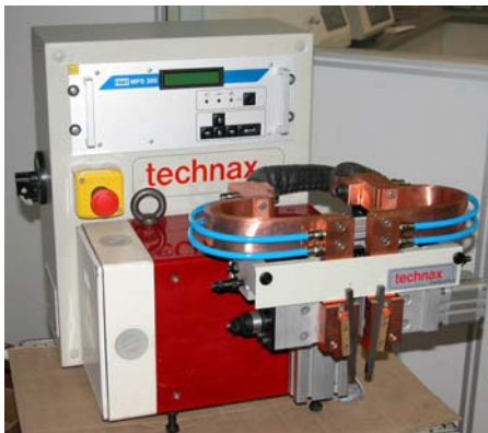
Model with horizontal head RPC70