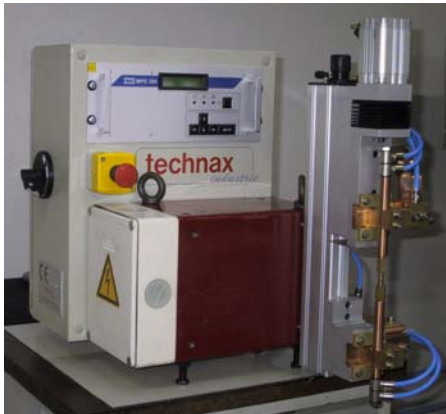
Model with vertical head TC70